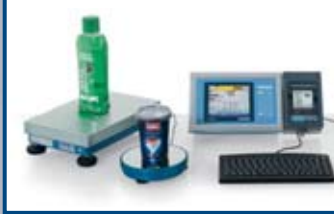
WEIGHING AND QUALITY CONTROL OF PRE-PACKAGED PRODUCTS