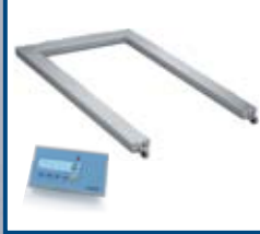
PALLET WEIGHING SCALES