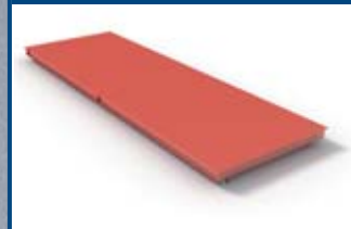
MODULAR ELECTRONIC WEIGHBRIDGES