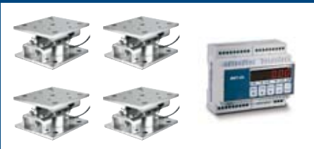
SPECIFIC WEIGHING KITS