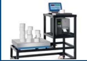
PORTABLE MULTI-SCALE SYSTEMS