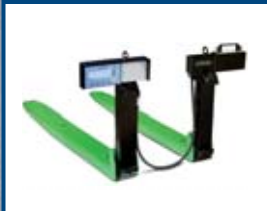
FORKLIFT TRUCK SCALES