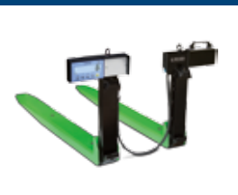
FORKLIFT TRUCK SCALES