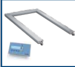
PALLET WEIGHING SCALES