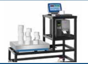
PORTABLE MULTI-SCALE SYSTEMS