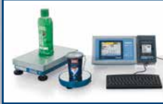
WEIGHING AND QUALITY CONTROL OF PRE-PACKAGED PRODUCTS