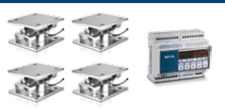
SPECIFIC WEIGHING KITS