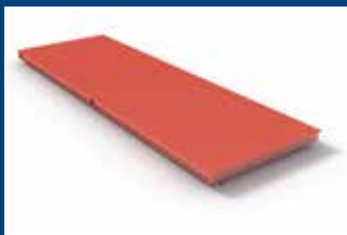
MODULAR ELECTRONIC WEIGHBRIDGES