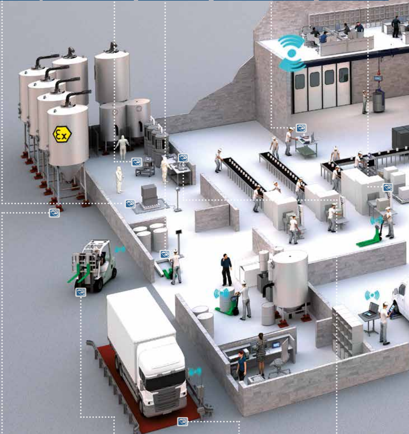
SPECIFIC WEIGHING KITS